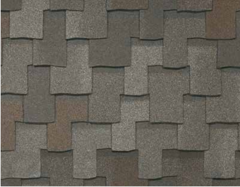
Armourshake - Chalet Wood