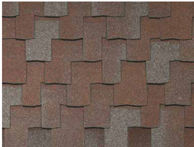
Armourshake - Western Redwood