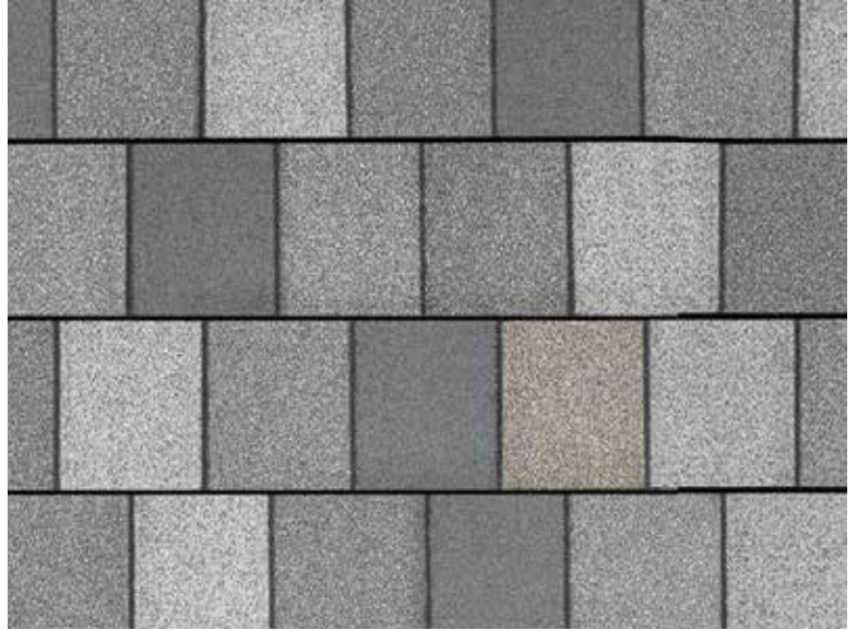
Crowne Slate - Regal Stone