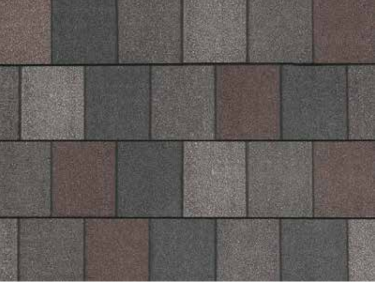
Crowne Slate - Royal Granite