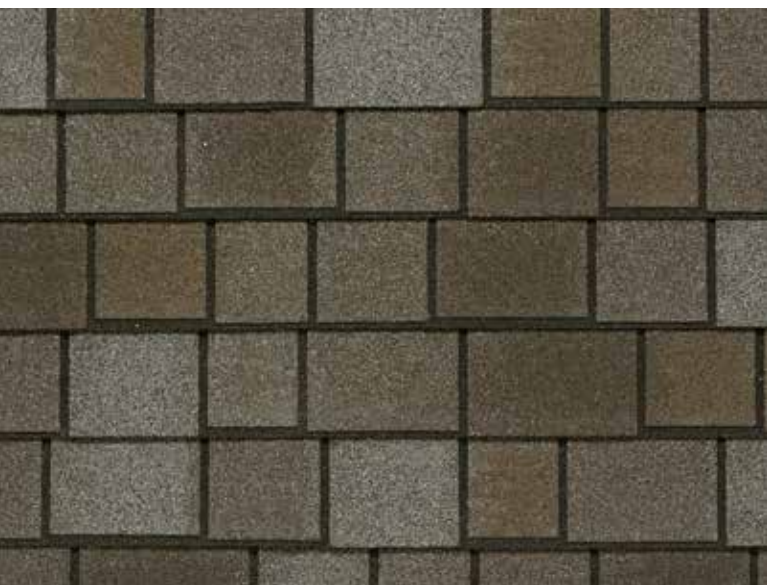
Royal Estate - Taupe Slate