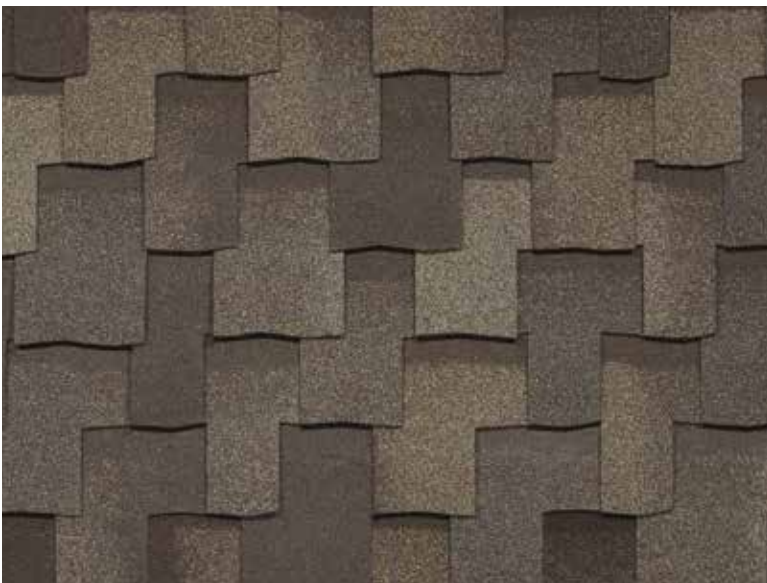
Armourshake - Weathered Stone