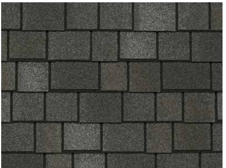
Royal Estate - Mountain Slate