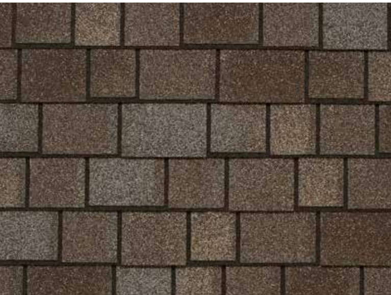
Royal Estate - Harvest Slate