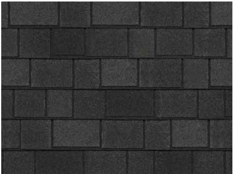
Royal Estate - Shadow Slate